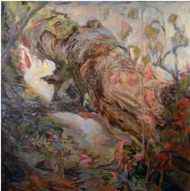
“Eden’s Tumultuous Destiny”, Oil on Canvas, 48”x 48”, 2006

2006-09 Drawing Coordinator (2009) Foundation Drawing and Painting Instructor.