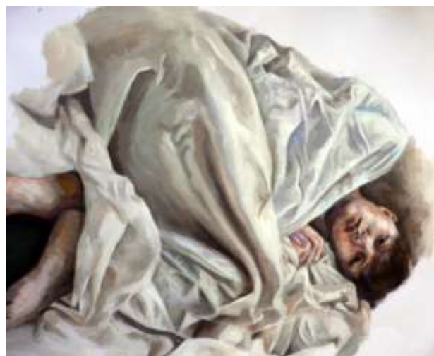
Student Work Acrylic Painting