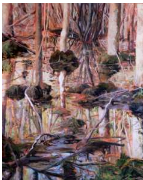
Moss Interval , 2005